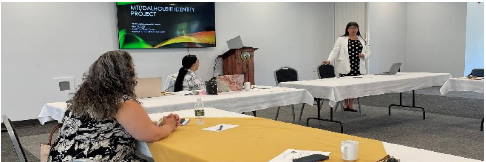
COVID 19 Gathering/Membership Forum